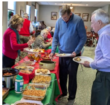
Christmas Pot Luck 12/8/24