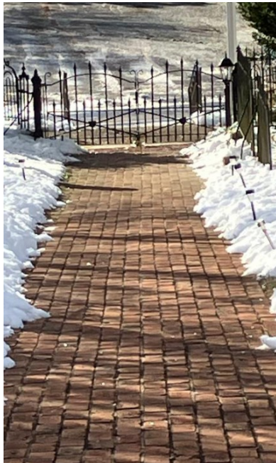
Thank you Wyatt for doing such a good job clearing the walks and parking lots for the January snow and ice storm.